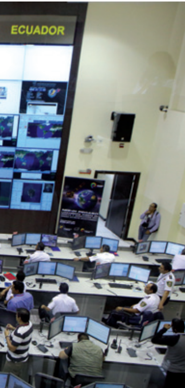
▲ The Ecuadorian control room prepares for the launch of their first satellite, Pegaso.